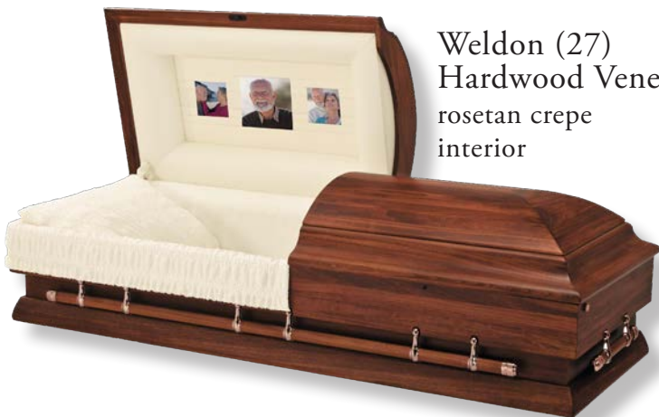
Weldon (27) Hardwood Veneer rosetan crepe interior