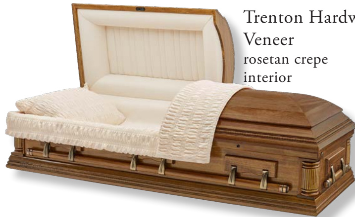
Trenton Hardwood Veneer rosetan crepe interior