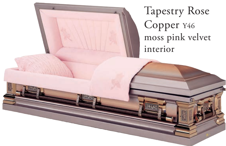
Tapestry Rose Copper Y46 moss pink velvet interior