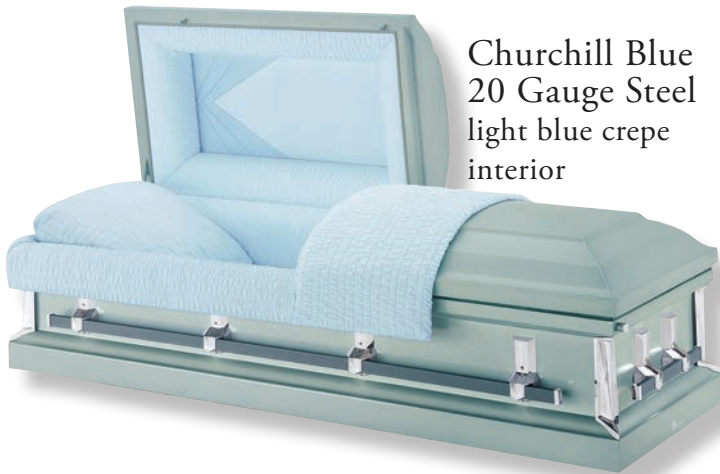
Churchill Blue 20 Gauge Steel light blue crepe interior