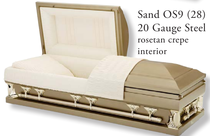
Sand OS9 (28) 20 Gauge Steel rosetan crepe interior