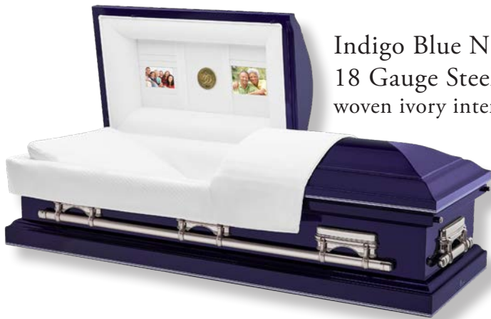
Indigo Blue NL1 18 Gauge Steel woven ivory interior