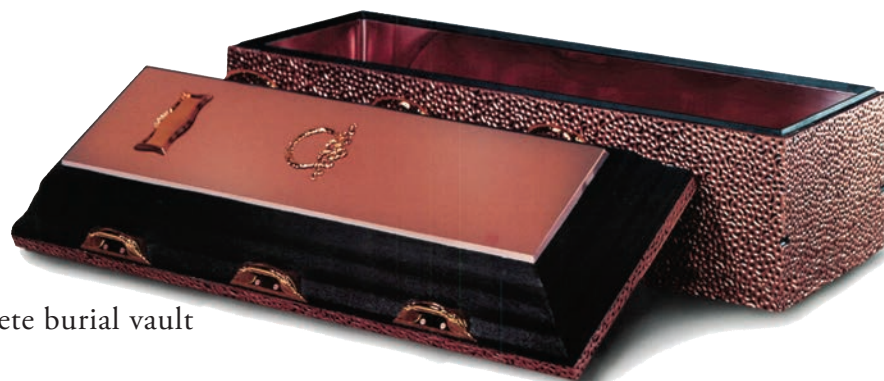
Copper Triune copper and polymer lined 3,000 lb. concrete burial vault