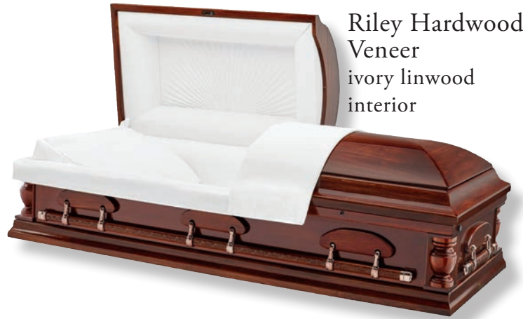
Riley Hardwood Veneer ivory linwood interior