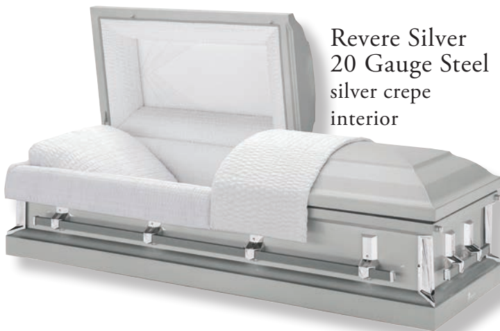
Revere Silver 20 Gauge Steel silver crepe interior