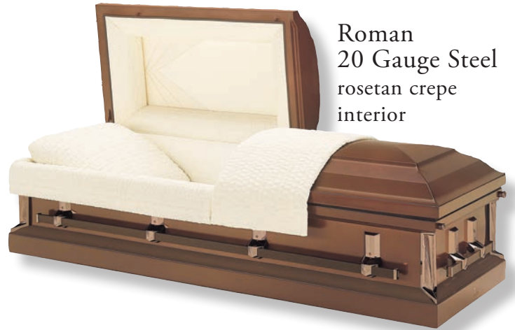
Roman 20 Gauge Steel rosetan crepe interior