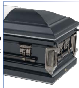
Neopolitan Blue M39 ivory velvet interior