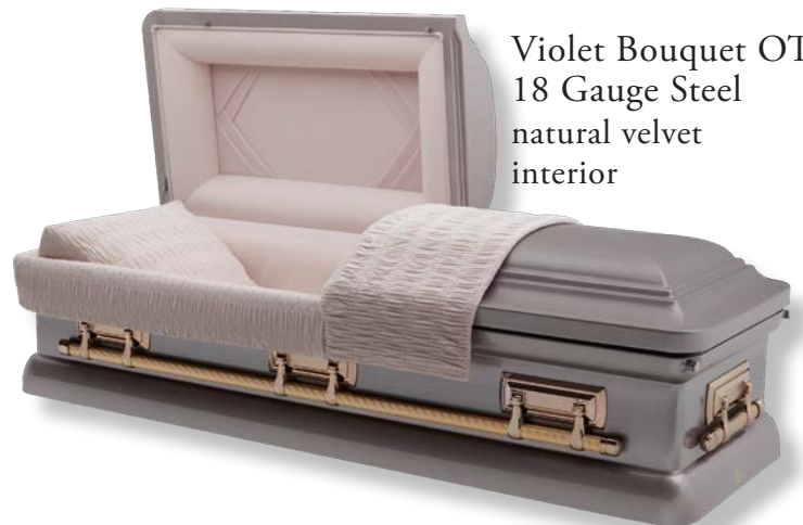
Violet Bouquet OT9 18 Gauge Steel natural velvet interior