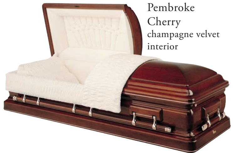
Pembroke Cherry champagne velvet interior