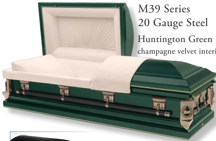
M39 Series 20 Gauge Steel Huntington Green M39 champagne velvet interior