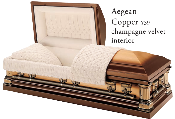
Aegean Copper Y39 champagne velvet interior