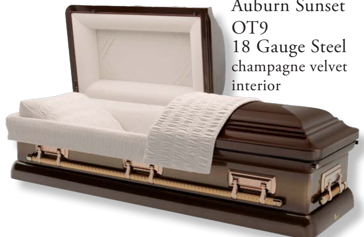
Auburn Sunset OT9 18 Gauge Steel champagne velvet interior