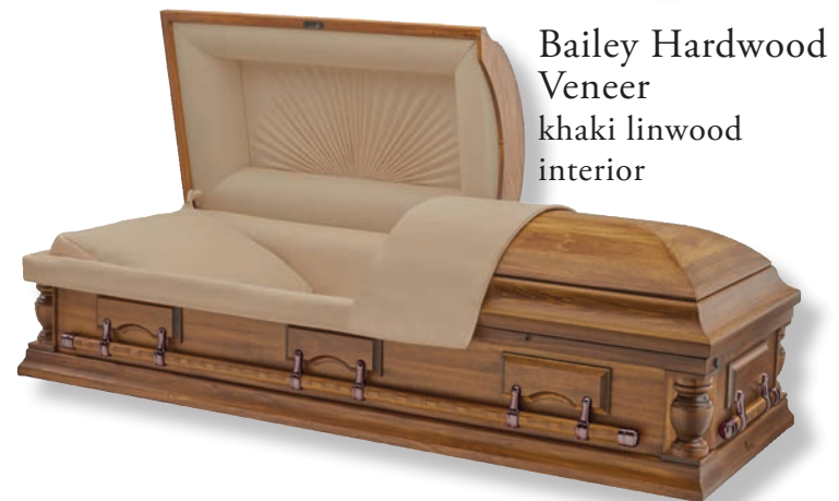
Bailey Hardwood Veneer khaki linwood interior

Aegean Healing Tree polymer wrapped, 2,600 lb. non-exposed concrete burial vault with tree of life cover