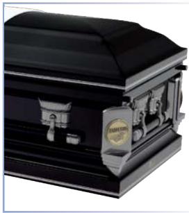
Midnight M39 ivory velvet interior