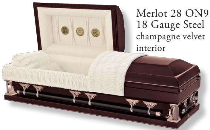
Merlot 28 ON9 18 Gauge Steel champagne velvet interior