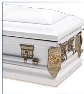
Carnation M39 ivory velvet interior