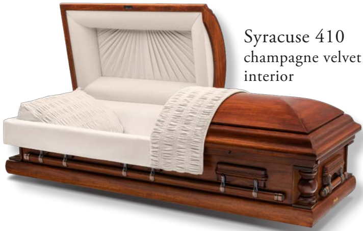
Syracuse 410 champagne velvet interior