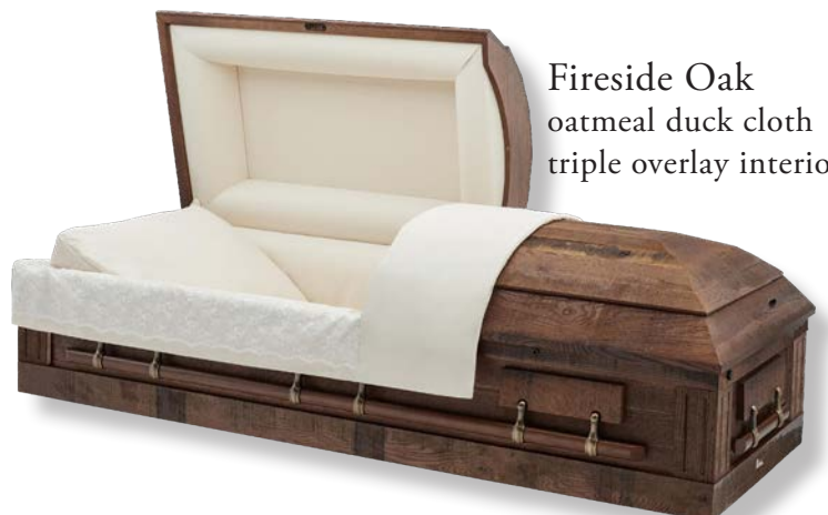
Fireside Oak oatmeal duck cloth triple overlay interior