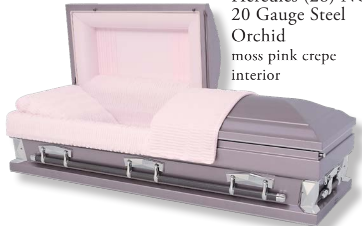
Hercules (28) NGS 20 Gauge Steel Orchid moss pink crepe interior

* Also available in Blue, Silver, and Black.