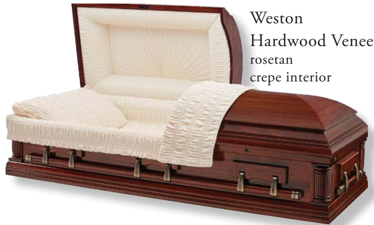
Weston Hardwood Veneer rosetan crepe interior