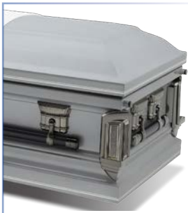
Revere Silver M39 ivory velvet interior