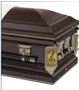
Auburn M39 champagne velvet interior