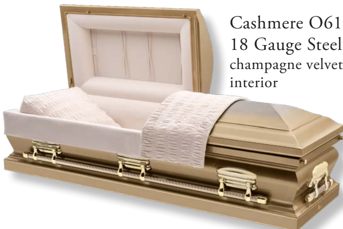
Cashmere O61 18 Gauge Steel champagne velvet interior