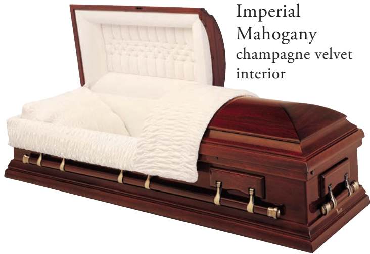
Imperial Mahogany champagne velvet interior