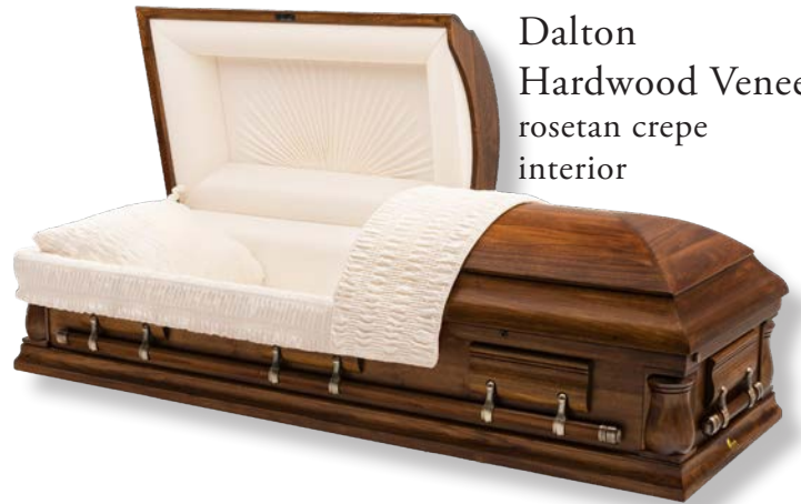
Dalton Hardwood Veneer rosetan crepe interior